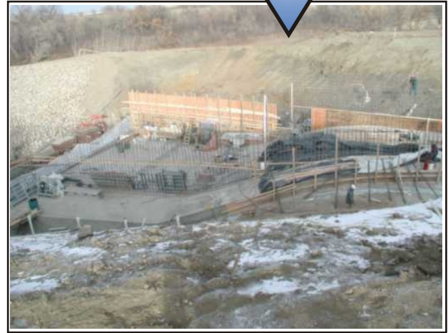
Figure 1. View of Dam Spillway

Difficulties arose during the construction of the spillway of a dam. Constructed monolithically in two 0.5 m layers, it was suspected that voids were present between the layers. The owners and their consultant PJ Materials Limited considered that it was imperative to detect and rectify the problem, to prevent premature deterioration due to freezing and thawing. Ground Penetrating Radar (GPR) was used in tight parallel traverses across the surface of the slab which were subsequently analyzed by computer to produce images of horizontal slices through the data. Figure 2 shows a slice of data at 0.5 m depth, the boundary between the two layers. The slices of data revealed that there were voids at the interface between the two monolithic layers. It was recommended that exploratory grout holes were extended through to the layer below which confirmed the presence of voids at the interface. Subsequent pressure grouting used over 200 litres of superfine cement and epoxy resin to fill the voids.