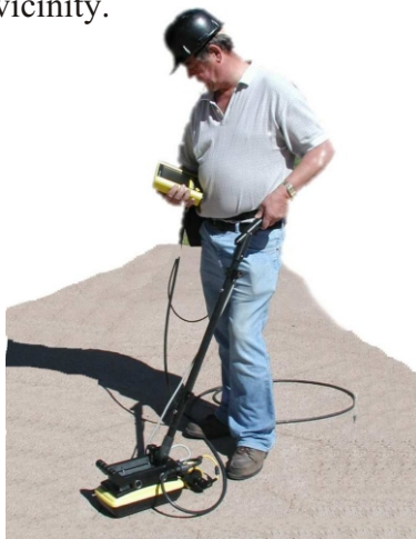
Figure 3. GPR in use

Figure 3 illustrates the ground penetrating radar equipment. It is a highly portable battery operated machine which uses high frequency radio waves similar to a cell phone and consequently poses no health hazard to the operator or anyone in the vicinity.